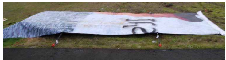
Example of proper storage